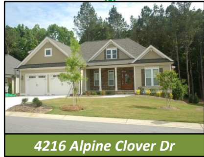
4216 Alpine Clover Dr

CAUTION Hobblebush Way is off a sharp curve on a hill – easy to go by accidentally in either direction.