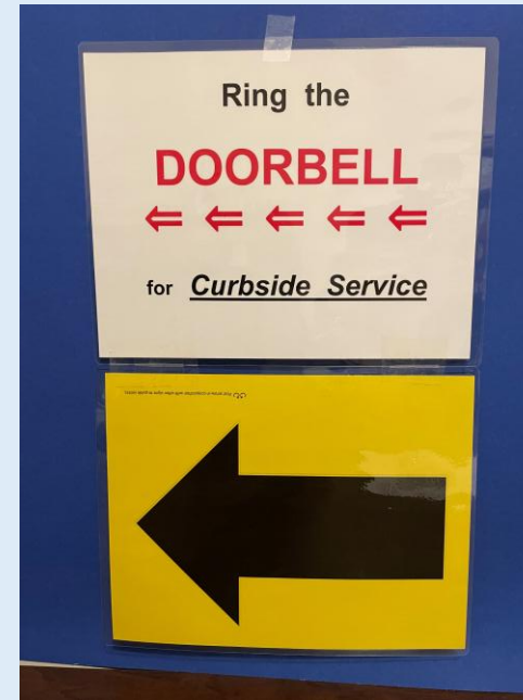
These two laminated signs are hung (stacked as shown) on some otherwise unused A-frame. The stand is placed on or near the sidewalk across from the doorbell stand. The arrows point to the curbside stand.