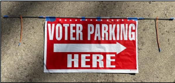
Sign and rod hung on the school's carpool traffic cones, as shown in the picture at the right.