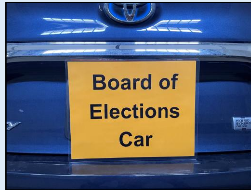
Laminated sign placed on the back of the Chief Judge's car to indicate it is parked legally at the end of the curbside area.